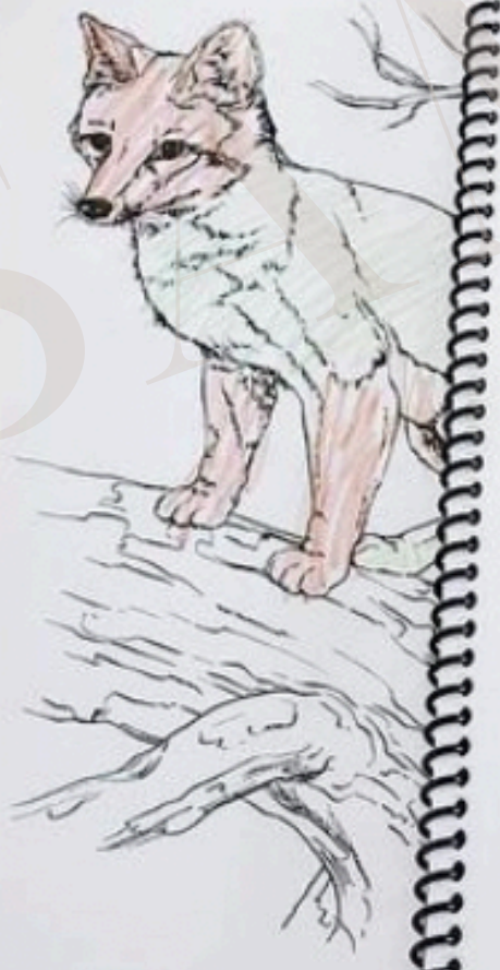
Gray Fox ( Urocyon cinereoargenteus ). About 45 in. Nocturnal hunter in open forests and shrubby regions through most of U.S. East in northeast quadrant and Mexico.